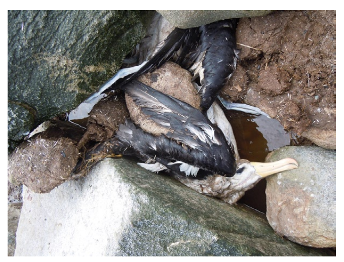
Fig. 2. Adult Black-browed Albatrosses pinned under boulders at Beauchêne Island after a storm event on 13 December 2010.

waves (Fig. 2). Smaller numbers of adult Rockhopper and Gentoo Penguins and Imperial Shags were also found dead in the Arena South colony (Table 1). In the days following the storm, some adult albatrosses, clearly exhausted and many waterlogged, were observed attempting to take off from the boulder beach, but were unable to gain sufficient height to fly over the large breaking waves. These birds were inevitably battered by the large waves, and some were observed being washed up on the shore of the western boulder beach, either dead or with broken wings. Seventeen of the injured or dead birds along the western boulder shore were entangled in kelp, wedged under Poa flabellata tussock bogs or under stranded Nothofagus tree trunks. The majority of severely injured birds that we were able to individually identify later died. However, we did not systematically search every section of each colony for dead and injured birds. Therefore the number of dead and severely injured birds recorded represented an unknown proportion of the total mortality. In addition, some dead birds, unrecorded by us, were probably washed out to sea. We do not know how many of the nesting Black-browed Albatrosses that we observed being washed out to sea on the evening of 13 December later died. Southern Giant Petrels Macronectes giganteus were observed mobbing