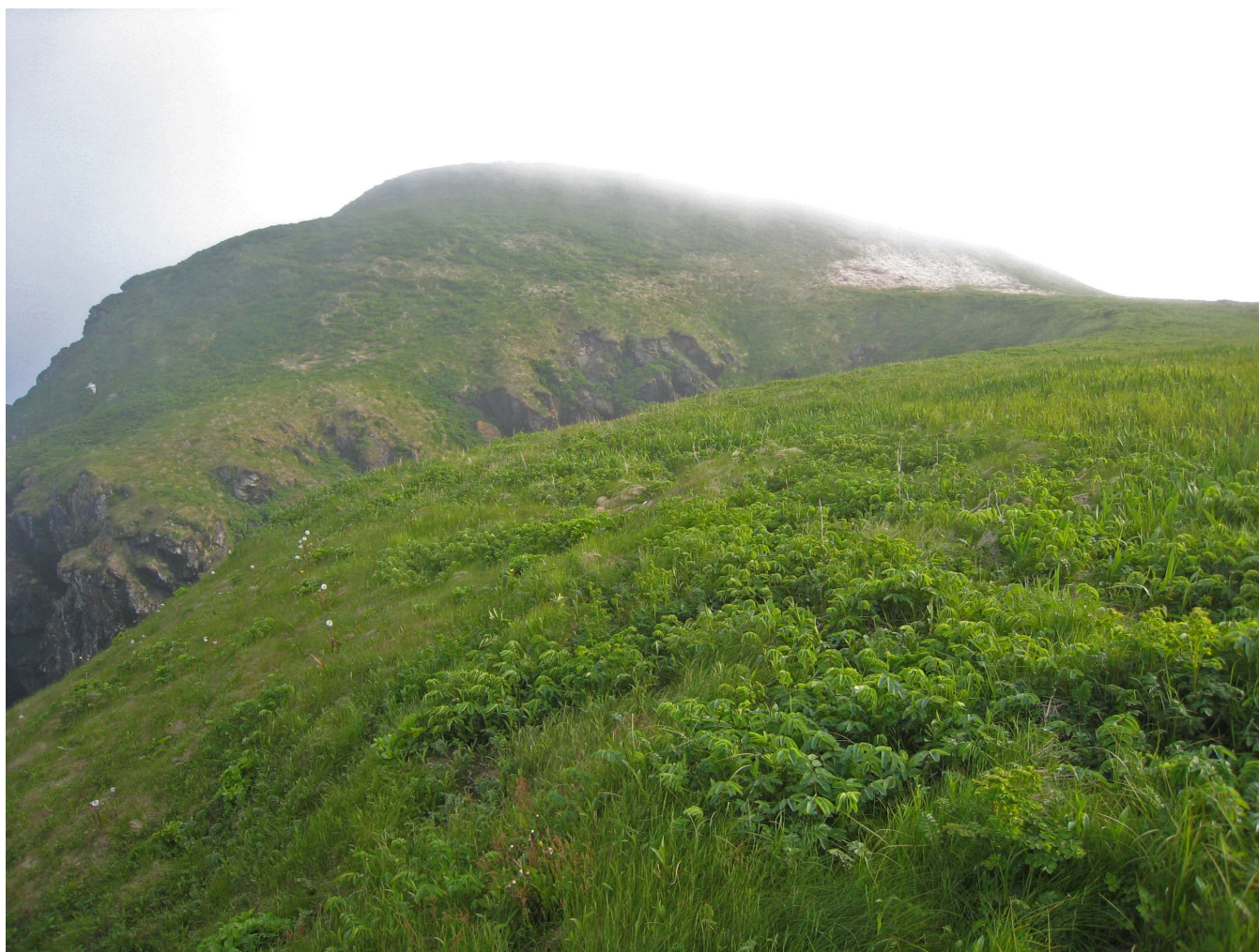
Middle Lawn Island, 2008, from the northeast corner of the island. The dead vegetation (west side) was likely caused by Canada Goose grazing. The primary Manx Shearwater areas (sections A–D on map) are in the distance (steeper parts of the slope). A few burrows were located in the foreground of the photo on the gentler slope.

Based on 220 banded birds and 79 recapture events, we estimated mean ( \pm SE) annual adult local survivorship of 0.70 \pm 0.04 (95% CI 0.60–0.78), mean starting population size of 194 \pm 43 (95% CI 130–301) individuals, and a projected mean population trend of \lambda = 0.94 \pm 0.04 (95% CI 0.86–1.02). Decomposing the population trend, 74% is due to the return of marked animals (0.70/0.94), while 26% is due to unmarked birds recruiting into the population. Annual recapture rates varied from 0.07 to 0.31. Of the recaptured birds,