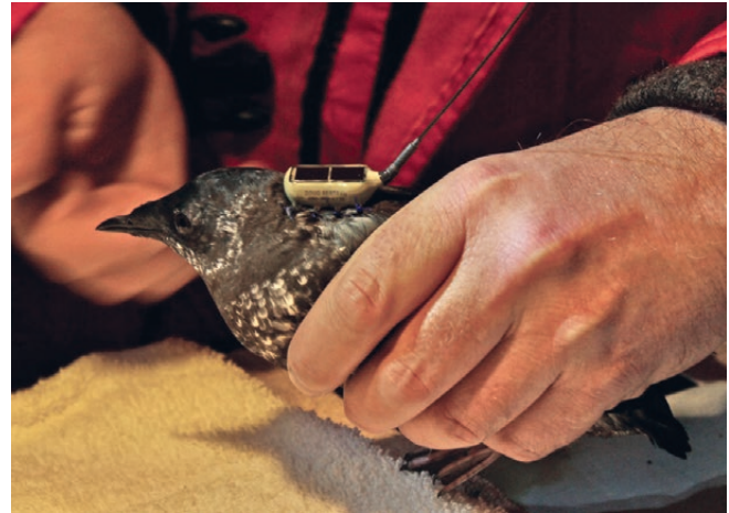
Fig. 1. Location of attachment of a 5 g solar satellite platform transmitter terminal (PTT) to a Marbled Murrelet on 18 April 2014 in Hartley Bay, BC, Canada.

algorithm over the traditional least-squares (LS) method is the ability to derive locations from as few as one transmission message (Lopez & Malardé 2011). This was an important advantage in our study, in which 33% of transmissions contained only one message, presumably due to a combination of behavioural and environmental (habitat) characteristics that obscured reception of the PTT signal by orbiting satellites (for example, incubation in dense forest cover and steep mountainous terrain). The resulting KF data were filtered using the Douglas Argos Filter (DAF; Douglas et al. 2012), available online through the animal tracking website Movebank ( www.movebank.org ). The DAF has been found to improve data accuracy by 50%–90% by removing implausible locations flagged