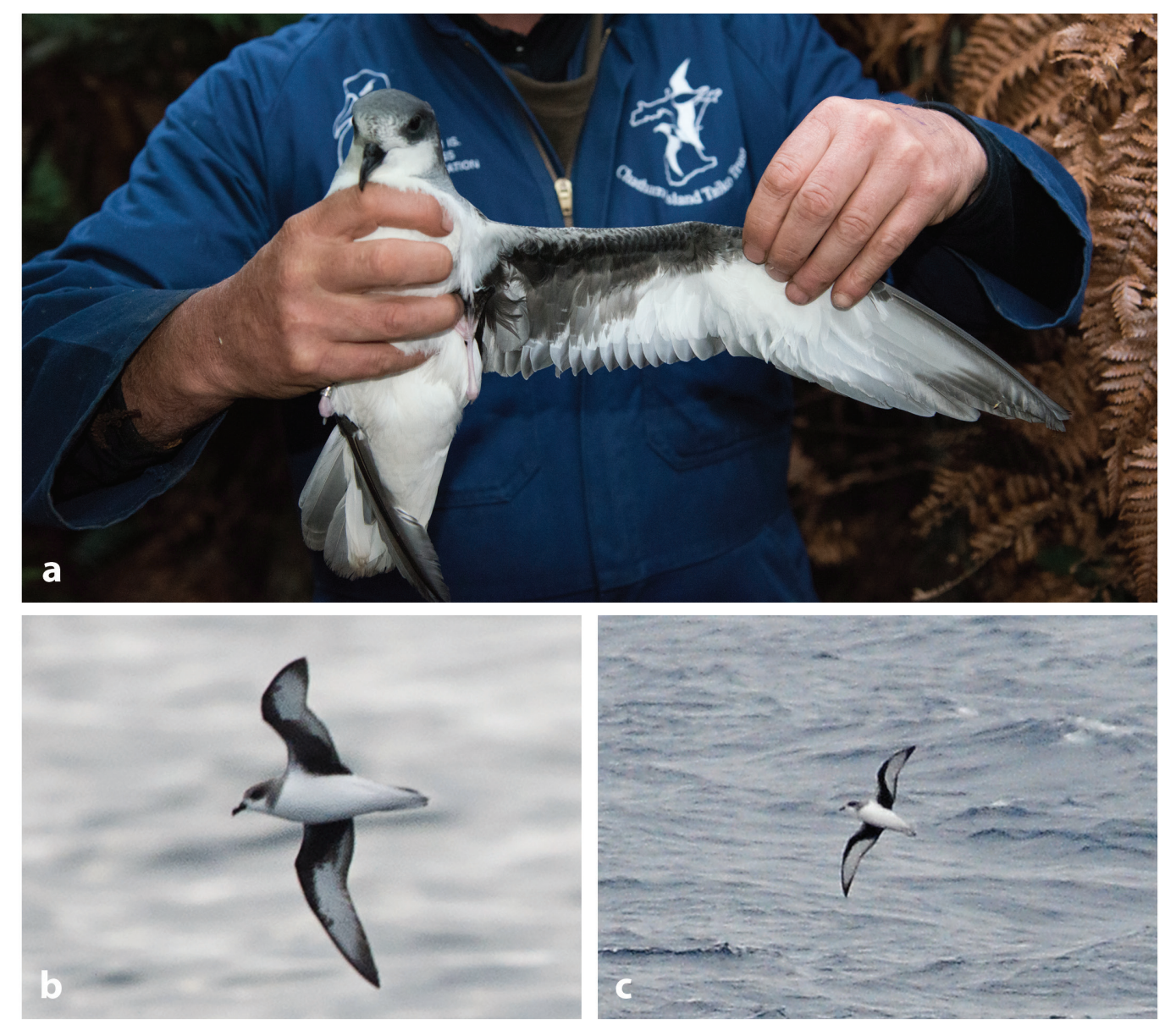
Fig. 1. Chatham Petrels: (a) Sweetwater Reserve, main Chatham Island, 15 January 2016 (Photo: Kirk Zufelt); (b) 9 km south of Rangatira Island, Chatham Islands, 18 January 2016 (Photo: Kirk Zufelt); (c) 39°39.5'S, 179°58.6'E, 264 km east of Napier, North Island, NZ, 12 January 2016 (Photo: Martin Gottschling).

The underwing pattern of Chatham Petrel is diagnostic. It has a thick, blackish leading edge to the inner forehand, and a long, broad diagonal ulnar bar, which, uniquely, extends to the wing base because of the blackish axillaries (Figs. 1a–c, 2c). Photographs of birds in the hand show that the forearm has whitish feathering restricted to a fine triangle of marginal and shorter lesser coverts along the inner half (base of triangle at the body), and the rear of the arm has a wider-based triangle of mainly median and greater