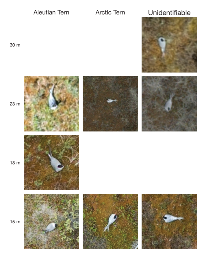
Fig. 2. Photos by the UAS of Aleutian and Arctic Terns at 30, 23, 18 and 15 m AGL. Examples of Arctic Tern images at the 18-m altitude were not available because this species was less likely to be on the nest late in the nesting season when we conducted the 18 m UAS flights. Photos were taken in June 2017 at the Headquarters Lake colony in southcentral Alaska.

On average, 1.2 terns were in the air during June UAS flights (n = 41 counts, range = 0–5). These counts were significantly lower than control counts (n = 44, mean = 3.2, range = 0–14) when the UAS was not operating, which was counterintuitive. Birds in the air varied more between days than between the control and UAS flight (Table 2), with higher numbers of birds in the air on the two days when the UAS was not flown. Because of the low overall colony count and the decidedly non-normal distribution of small-valued counts, there was little power