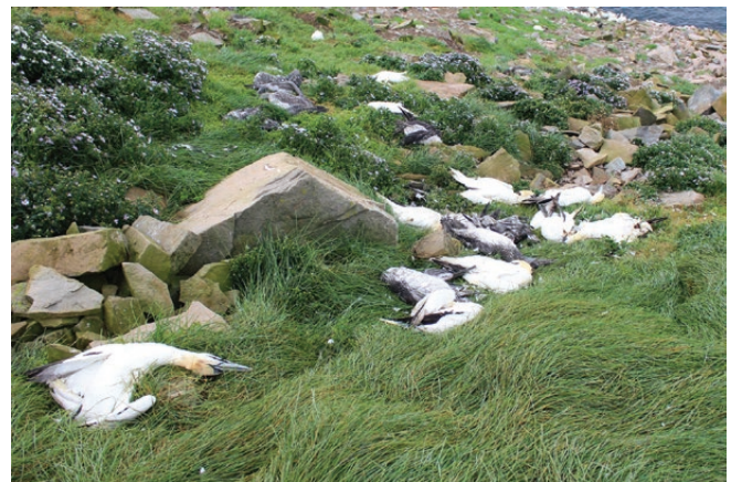
Fig. 4. Northern Gannet carcasses aggregated by eastern coyotes above nesting cliffs (photo: Bill Montevecchi).