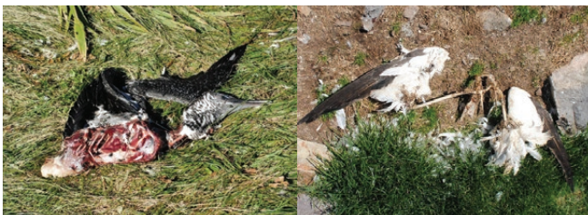
Fig. 3. Left: pre-fledgling Northern Gannet with pectoral muscle eaten; Right: adult Northern Gannet entirely consumed except for wings and skeletal remains (photos: Kyran Power).