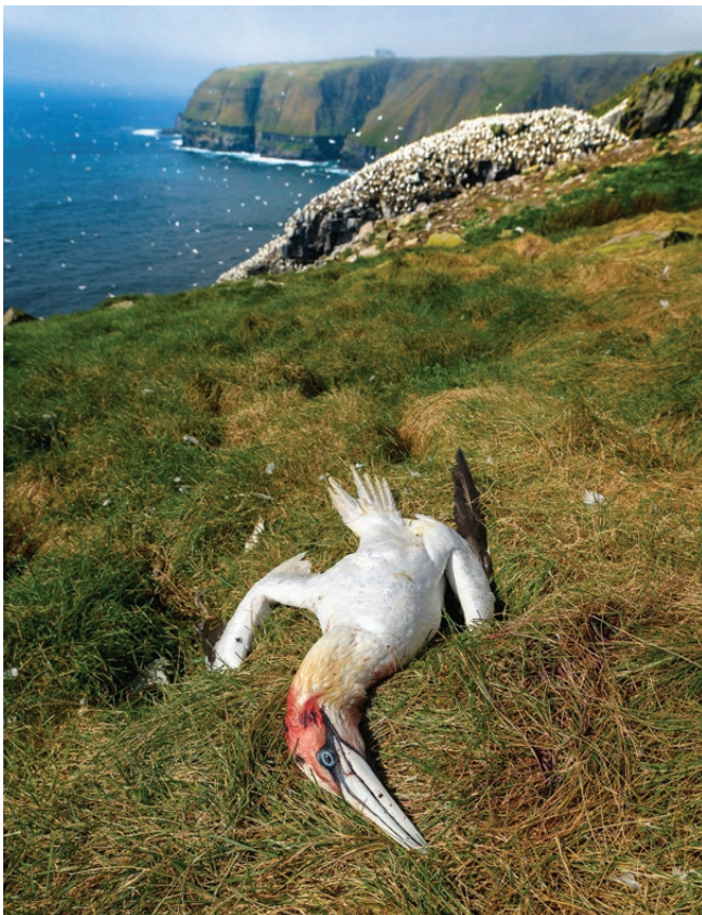
Fig. 2. Adult Northern Gannet carcass with cranial puncture.

Foxes are common at Cape St. Mary's, and observations of silver and cross foxes are indicative of escapes from nearby fur farms. A red fox was seen near the colony on 19 September 2018; there was no evidence of further predation by coyotes thereafter. On Bonaventure Island (Quebec), red foxes were observed scaring gannets from roosting and peripheral nesting areas. This disturbance