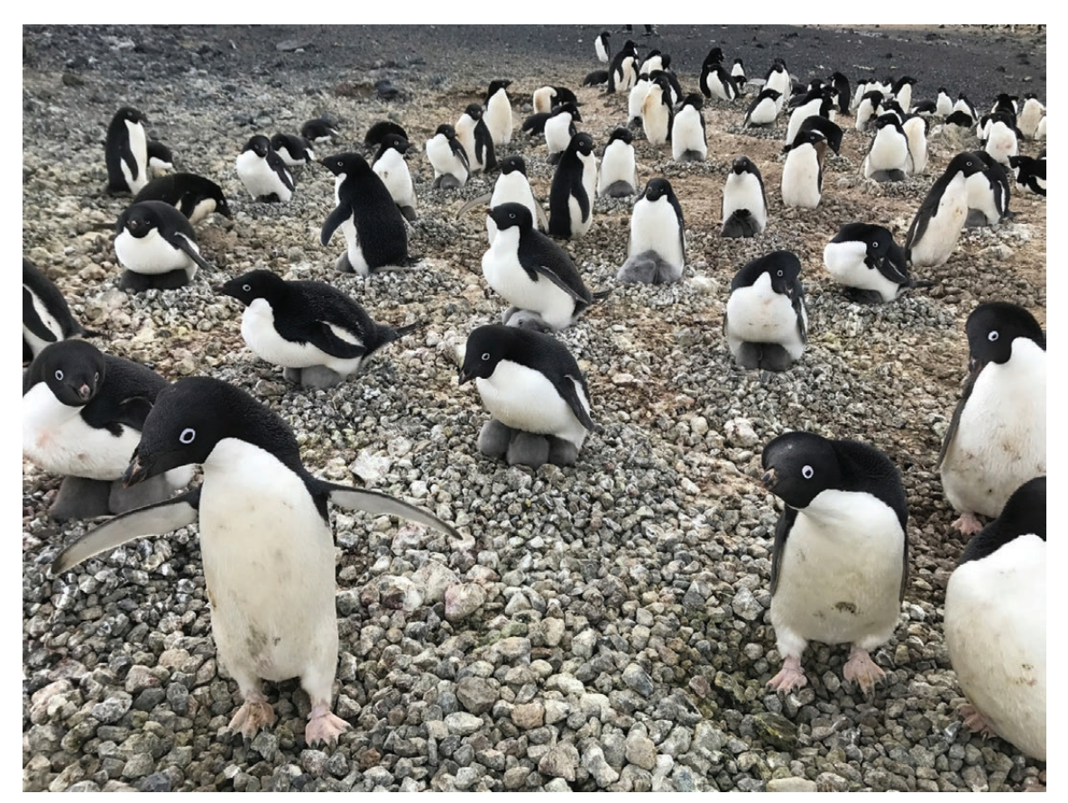
Fig. 2. Adelie penguin (center) brooding three chicks at the Cape Crozier colony, Ross Island, on 23 December 2017.

Two different observations were carried out to estimate the prevalence of three eggs or chicks at this colony. First, 265 nests of banded known-age Adelie Penguins were monitored throughout the breeding season (20 October to 28 December), and the entire colony was searched for banded birds at least once a week. During these regular surveys, we opportunistically documented nests with three eggs, three chicks, or two chicks and one egg. Second, every four days between 18 and 28 December, we surveyed all nests in a sub-colony consisting of 1189 active breeding pairs (about 0.40 % of the Cape Crozier colony) to record the number of nests that contained more than two chicks or eggs. We stopped observations of three-chick nests on 28 December, a date that corresponded to the start of crèching.