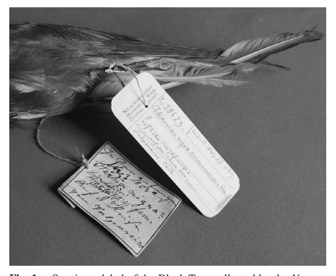
Fig. 1. Specimen label of the Black Tern collected by the Novara expedition in Chile (NMW 38679).

August von Pelzeln had the task of describing the birds collected during the voyage of the frigate Novara when it circumnavigated the globe (1857–1859). In his report, he mentioned the collection of Hydrochelidon plumbea (= Chlidonias niger ) (NMW 38679) and he wrote "Chile - Ein Weibchen im See gefangen", which translates to "Chile - a female caught in a lake". No other information was provided (von Pelzeln 1865). The original label (Fig. 1) and the catalogue entry indicated "in See gefangen auf der Reise von