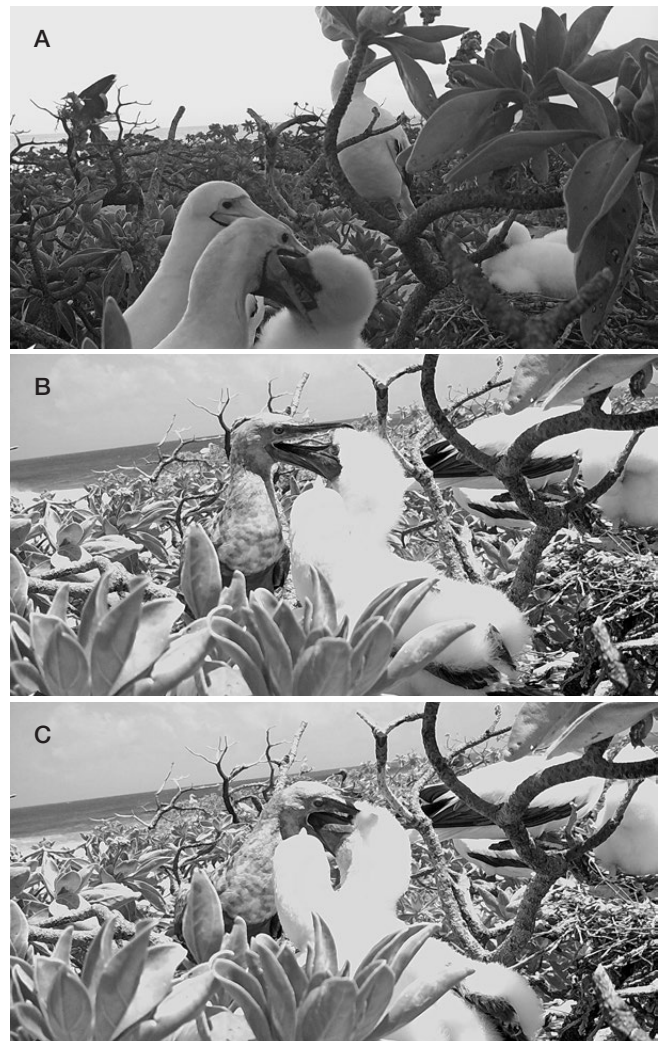
Fig. 1. Photos taken with a camera trap at a Red-footed Booby Sula sula nest, Tromelin Island. A) The two adults with the chick, with one adult feeding the chick. B, C) The immature bird feeding the chick. More photos and videos are available upon request from the first author.

On two occasions, we also observed the immature bird showing alarm behaviour and defending the chick while we were catching the chick for measurement. We obtained a few photos and video footage of the two adults with the immature bird and found no evidence of aggressive or territorial behaviour between them, suggesting that they knew each other. Notably, the immature bird guarded the chick for seven minutes alone on 02 October (i.e., without either adult nearby). Normally, chicks of this age are almost permanently guarded by one parent; if another bird perches next to the nest, the guarding adult would immediately chase it aggressively. The fact that the immature bird was not chased and was left alone with the chick suggests that it was familiar to both the parents and the chick. Collectively, our observations indicate that the behaviours that we captured during our short-term camera trap survey were not incidental. The immature bird and the two breeding adults formed a stable trio that cooperated to raise the