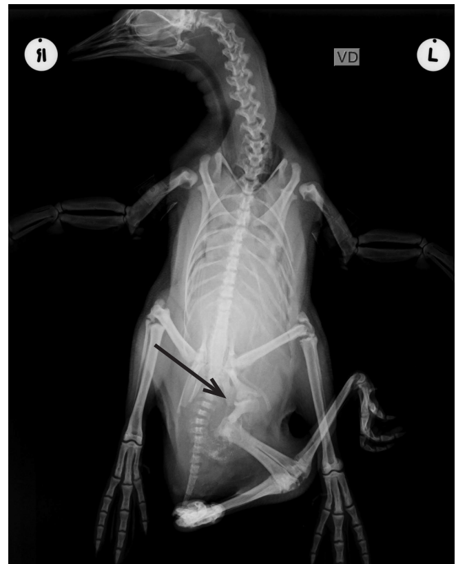
Fig. 1. Radiograph of supplementary limbs of an African Penguin Spheniscus demersus chick; arrow indicates where both femur shafts were fused at the base of the ischium.

Besides the multiple supplementary limbs that provided justification for euthanasia, the penguin was found to be healthy and had no other significant pathological findings on necropsy. At 2.3 kg, the bird was in good physical condition, with well-developed chest