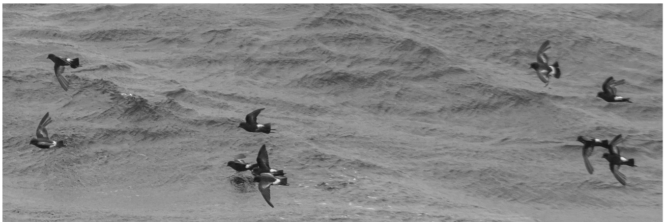
Fig. 1. A small part of aggregations totaling hundreds of molting Fuegian/Pincoya Storm Petrels Oceanites [oceanicus] chilensis/pincoyae off south-central Chile (43°S, 75°W), 18 January 2024.

This enigmatic taxon apparently has a breeding range that lies between northern and southern breeding populations of Fuegian,