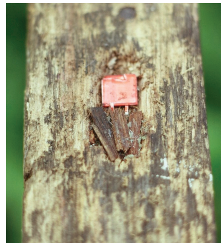
Fig. 2. View from above of piezo-electric microphone that was placed on top of the wooden T-piece where one of the White Terns Gygis alba incubated its egg. Wood chips embedded in paste protect the leads to the microphone from damage by the bird's feet.

The advantage of this method over more sophisticated telemetric techniques is that it does not require handling the bird or attaching any equipment to it. Because the recording system does not touch the bird, it does not affect the parameter being measured. There is also no need to replace the egg with a dummy containing the instrument (e.g., Kneis & Kohler 1977, Nimon et al. 1996), so our method minimizes disturbance to both the bird and its egg.