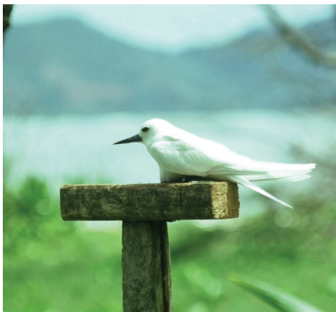
Fig. 1. Adult White Tern Gygis alba incubating egg on a wooden T-piece 1.5 m above the ground. The cable to the microphone can be seen running up the right-hand side of the vertical support.

Heartbeats were clearly audible through earphones and could be tape-recorded simultaneously. Using a stopwatch, we counted the number of beats heard in intervals of 5 s or (mostly) 10 s and made at least 10 measurements on each occasion. All measurements were later converted to beats per minute. Diastole and systole, while distinguishable on the oscillograph, could not be heard separately, so each beat recorded corresponds to one complete contraction of the heart (Fig. 3).